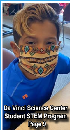
Da Vinci Science Center Student STEM Program Page 9