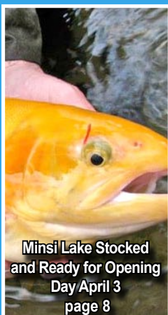
Minsi Lake Stocked and Ready for Opening Day April 3 page 8