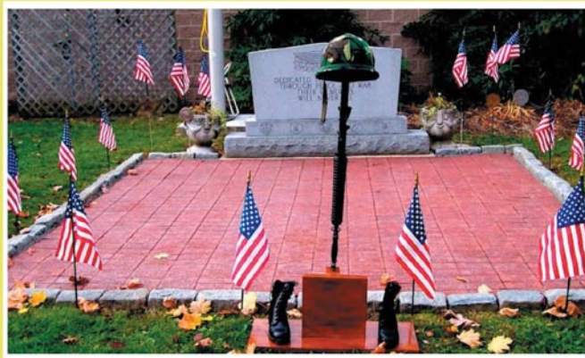
THE BRICK MEMORIAL AT BANGOR PARK, A LIST OF VETERAN'S LISTED IN 648 BRICKS.