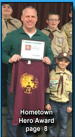
Hometown Hero Award page 8