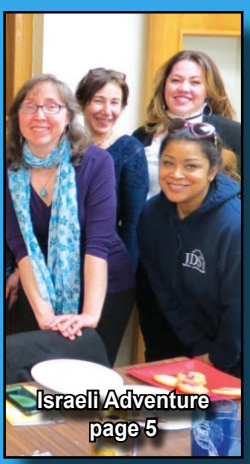
Israeli Adventure page 5