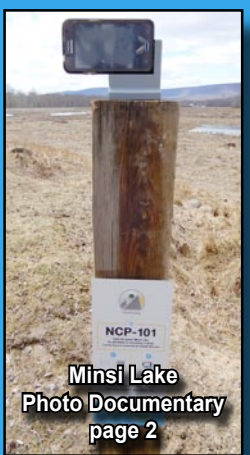
Minsi Lake Photo Documentary page 2