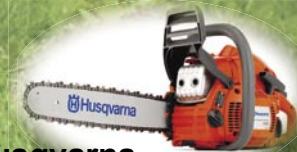
Husqvarna Chain saw