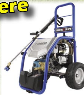
Yamaha pressure washers