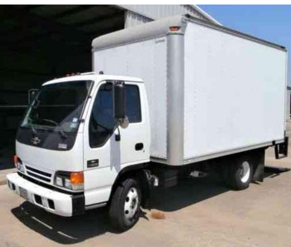
Photo is a sample of the 15' box truck with a lift gate the Mission of Love Food Bank/Pantry will be purchasing with the $50,000 LSA grant they were just awarded.

LSA grants support economic development, job training, community improvement and public interest projects through gaming funds under Act 71 of 2004. These specific grants come from Monroe County, which funds projects in Monroe and its contiguous counties.