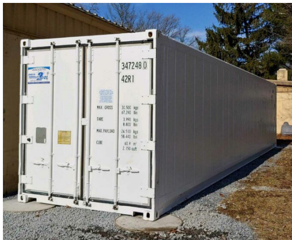
The expansion also includes a prior grant from Waste Management for $10,000 for an outdoor walk in freezer (8' X 42') that was delivered in February this year that they will also share with the PUMP.