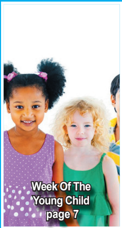
Week Of The Young Child page 7