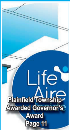
Life Aire Plainfield Township Awarded Governor's Award Page 11