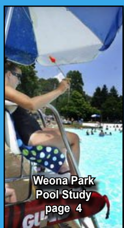
Weona Park Pool Study page 4