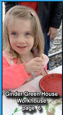
Ginder Green House Workhouse page 6