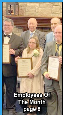
Employees Of The Month page 8