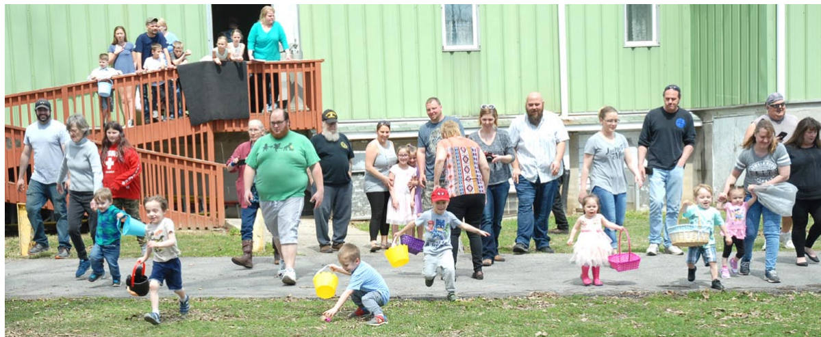
Bangor VFW Egg Hunt Continued from page 1