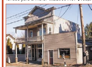
GREAT PROPERTY WITH MULTIPLE USE POTENTIAL! The 1st floor of this building boasts the studio and several open rooms with endless possibilities. The 2nd floor was converted to a 3/4 bedroom apartment, with brand new updated. Live upstairs and rent the 1st floor to any business, or own and operate your own business while still living separately from the business itself! MLS 604188 $192,000