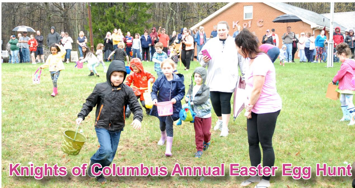
Knights of Columbus Annual Easter Egg Hunt