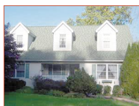
BEAUTIFUL! CHARMING 4-BED, 2-BATH CAPE features hardwood, parquet & tile floors, large master on first floor, one car attached garage, scheduled use of Tuscarora conference center amenities. Located in Tuscarora village only minutes to route 80,94 &46! MLS#595218 $190,900