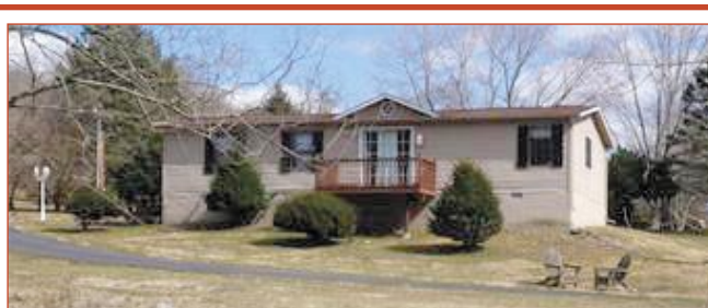
SPECTACULAR LOCATION IN THE COUNTRY!!! This well maintained ranch style home has open concept between kitchen, dining area and living room w/ high ceilings. Newer stainless steel refrigerator and gas stove make the kitchen a pleasure to work in. Master bedroom w/ en-suite bathroom & garden tub. 2 other bedrooms & full bath. Large 2 acre corner lot includes a flowing stream, 2 car detached garage. Living in the country, but minutes away from NJ! MLS#604739 $185,000