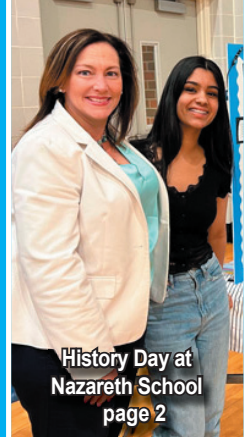
History Day at Nazareth School page 2