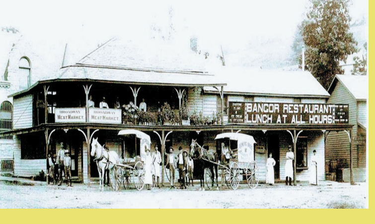
Isn't This A Great Photo Of Long Ago. It Would Be Great To Go Back And Find Out What Was Going On. This Area Is Now A Parking Lot And The Library.