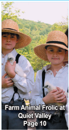
Farm Animal Frolic at Quiet Valley Page 10