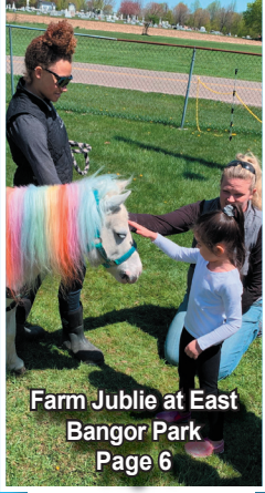
Farm Jublie at East Bangor Park Page 6