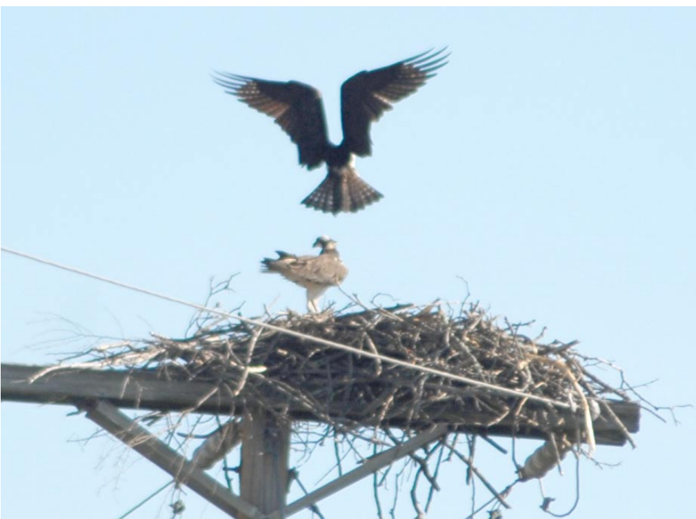
Bottom: Another Osprey nesting couple in Upper Mt. ethel