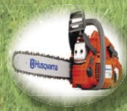
Husqvarna Chain saw

Our selection of off-road and lawn equipment includes Polaris ATVs, Ranger utility vehicles, and snowmobiles; Ski-Doo snowmobiles; Husqvarna power equipment and mowers, Can-Am ATVs, Spyders and UTV's; Scag Commercial Mowers; Cub Cadet lawnmowers and tractors; Yamaha generators and pressure washers.