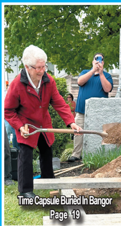
Time Capsule Buried In Bangor Page 19