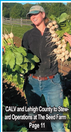
CALV and Lehigh County to Steward Operations at The Seed Farm Page 11