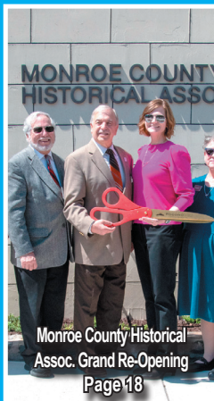
Monroe County Historical Assoc. Grand Re-Opening Page 18