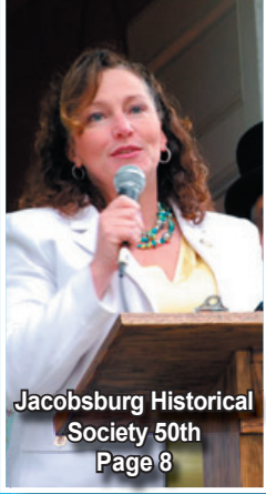
Jacobsburg Historical Society 50th Page 8