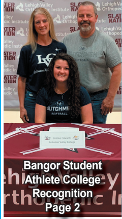
Bangor Student Athlete College Recognition Page 2