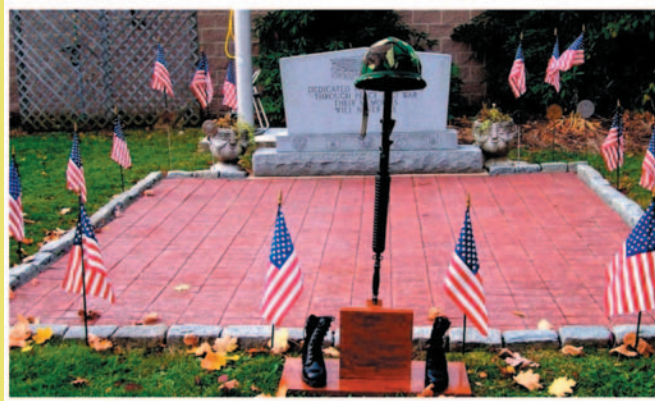
THE BRICK MEMORIAL AT BANGOR PARK, A LIST OF VETERAN'S LISTED IN 648 BRICKS.