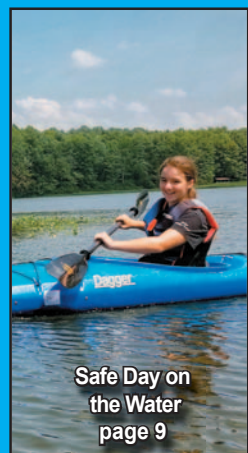
Safe Day on the Water page 9