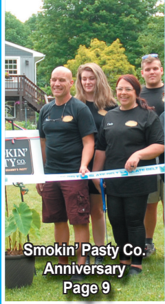
Smokin' Pasty Co. Anniversary Page 9