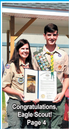
Congratulations, Eagle Scout! Page 4

COLUMBIA STORAGE GROUP Columbia Self Storage