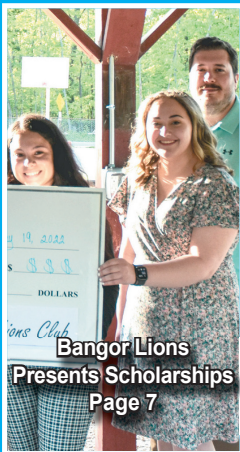
Bangor Lions Club Presents Scholarships Page 7