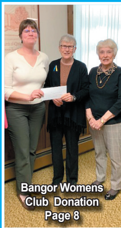
Bangor Womens Club Donation Page 8