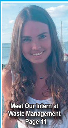
Meet Our Intern at Waste Management Page 11

COLUMBIA STORAGE GROUP Columbia Self Storage