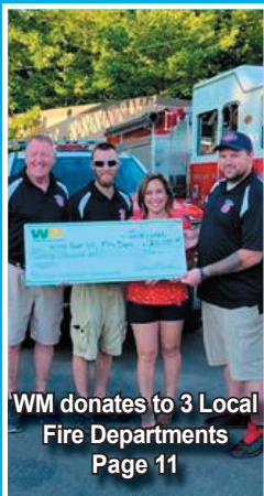
WM donates to 3 Local Fire Departments Page 11