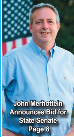
John Merhoffein Announces Bid for State Senate Page 8