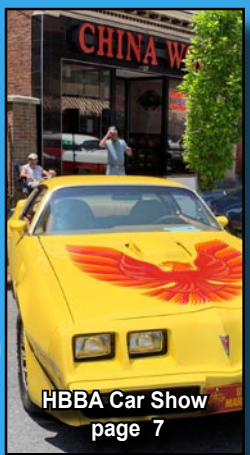
HBBA Car Show page 7