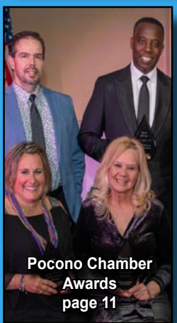
Pocono Chamber Awards page 11