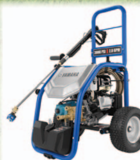
Yamaha pressure washers