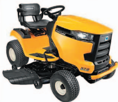
Cub Cadet XT Enduro Series