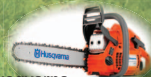
Husqvarna Chain saw