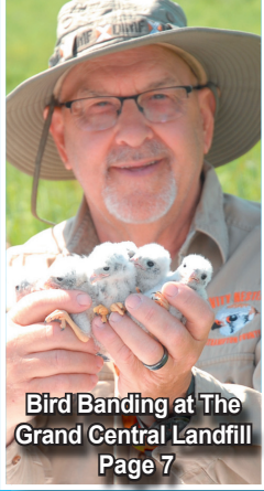
Bird Banding at The Grand Central Landfill Page 7