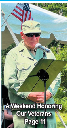
A Weekend Honoring Our Veterans Page 11