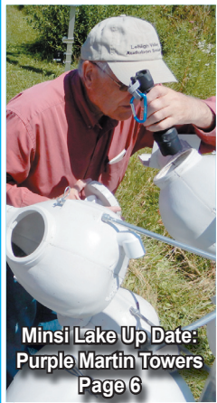
Minsi Lake Up Date: Purple Martin Towers Page 6