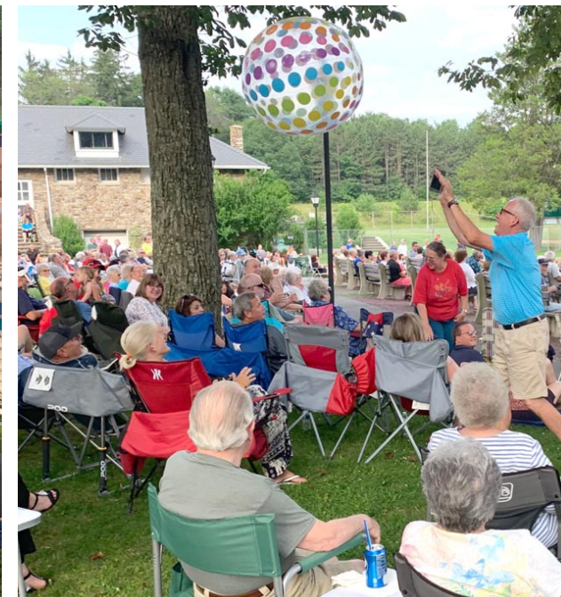
The 'Party Ball'