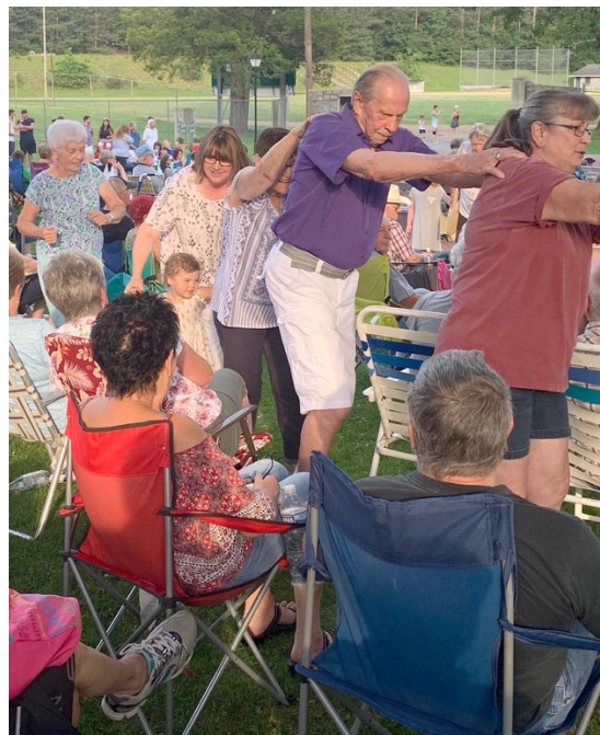
The 'Dance Train'