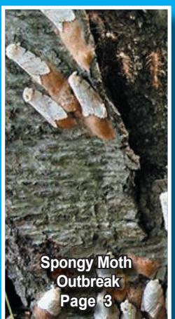
Spongy Moth Outbreak Page 3