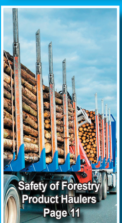
Safety of Forestry Product Haulers Page 11