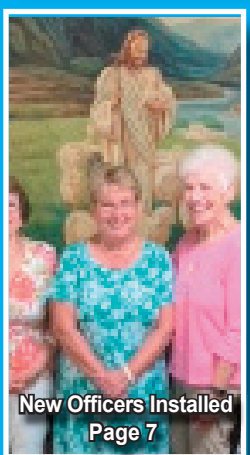
New Officers Installed Page 7