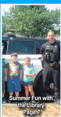
Summer Fun with the Library Page 7