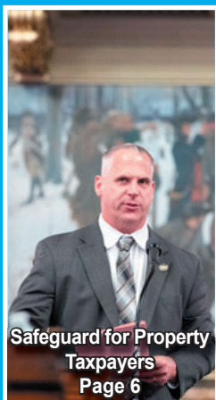
Safeguard for Property Taxpayers Page 6