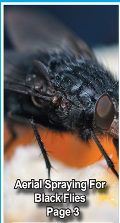
Aerial Spraying For Black Flies Page 3