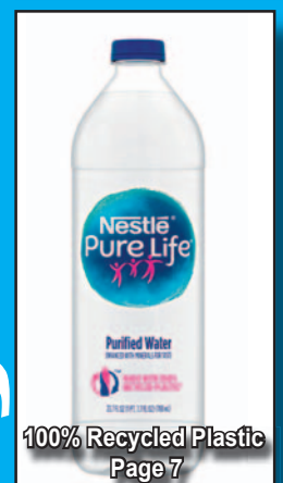
100% Recycled Plastic Page 7