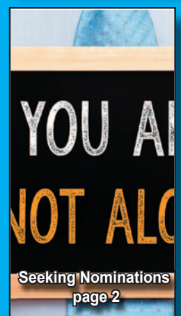
Seeking Nominations page 2