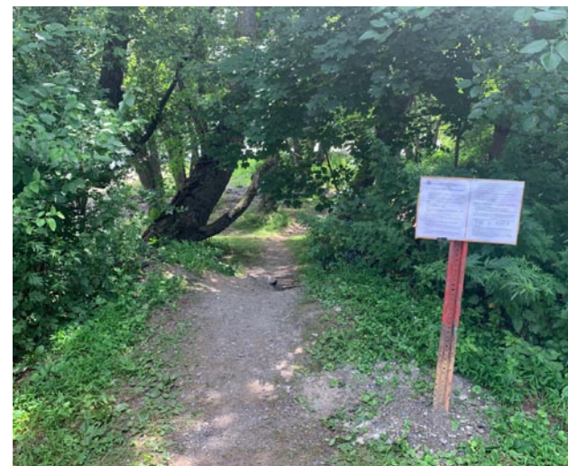
Entrance to the Park with rules and regulations clearly posted for every park visitor