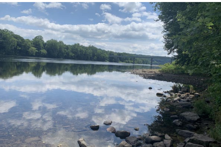
This is how the park should look all the time, imagine it with trash sperad all over it every weekend