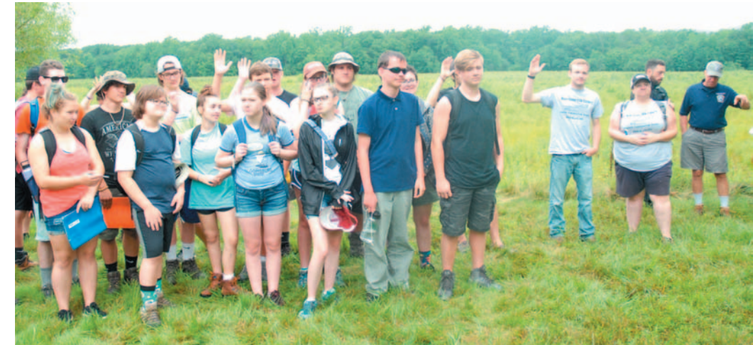
Northampton County Jr. Conservation brought a bus load of their summer campers to see and learn about the lakes new fish habitat structures and why the lake needs them.