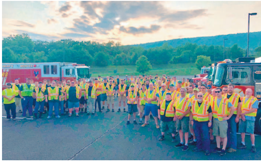
Firemen from Plainfield Township, Wind Gap, Pen Argyl (Lookout Fire Company #1), Bushkill Township and Klecknersville.

SPORTING GOODS 31 W. 1st Street, Wind Gap 610-863-4600 FUSIA E