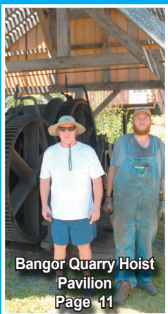
Bangor Quarry Hoist Pavilion Page 11