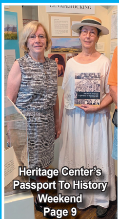
Heritage Center's Passport To History Weekend Page 9