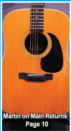
Martin on Main Returns Page 10