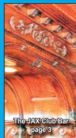
The JAX Club Bar page 3