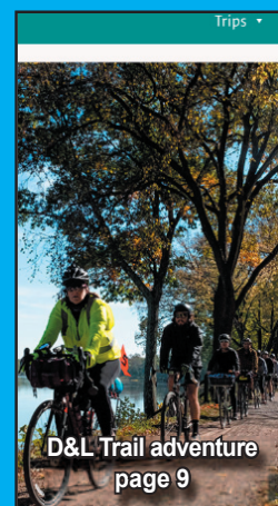
D&L Trail adventure page 9