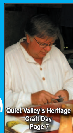
Quiet Valley's Heritage Craft Day Page 7

THE PUBLIC AND THE PRIVATE SECTOR DESERVE ANSWERS GOV. WOLF, SIGN HOUSE BILL 24 TO IMPROVE TRANSPARENCY Government Transparency page 5