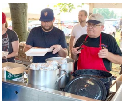
Winner Winner Chichen Dinner!