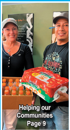
Helping our Communities Page 9