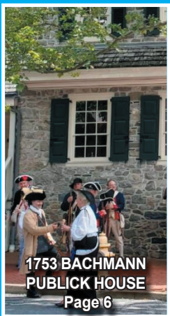
1753 BACHMANN PUBLICK HOUSE Page 6