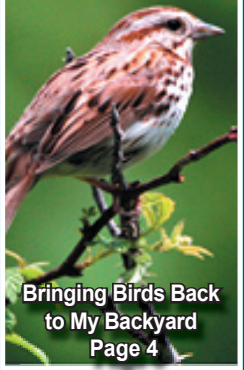
Bringing Birds Back to My Backyard Page 4