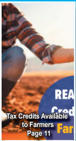
Tax Credits Available to Farmers Page 11