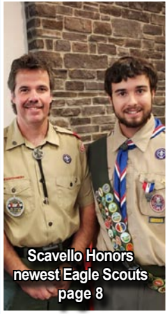
Scavello Honors newest Eagle Scouts page 8