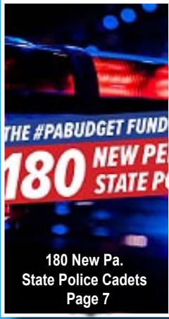
180 New Pa. State Police Cadets Page 7