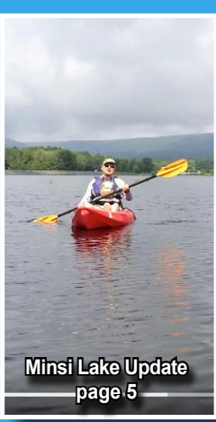
Minsi Lake Update page 5