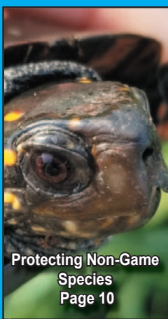
Protecting Non-Game Species Page 10