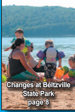
Changes at Beltzville State Park page 8

SERVING THE SLATE BELT, SOUTHERN POCONOS & NORTHERN N.J. VOL. 29 NO. 32 WEEKLY IN PRINT AND DAILY ONLINE AT WWW.BLUEVALLEYTIMES.COM AND FACEBOOK AUGUST 4, 2020