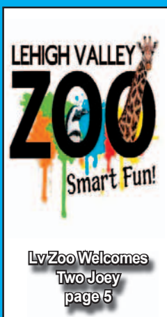
LvZoo Welcomes Two Joey page 5