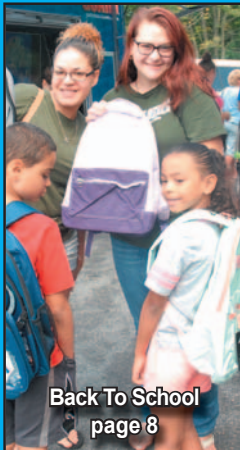
Back To School page 8