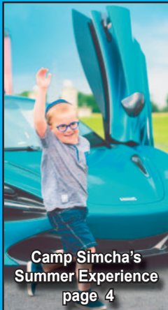
Camp Simcha's Summer Experience page 4