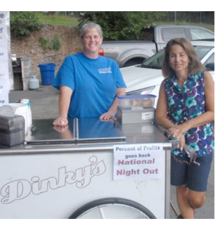
Roseto Night Out