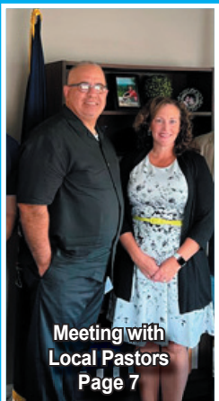
Meeting with Local Pastors Page 7