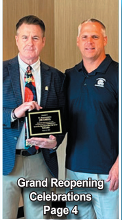
Grand Reopening Celebrations Page 4

For more information on Old Home Week festivities, which wrap up today/Friday, visit the borough's website here.