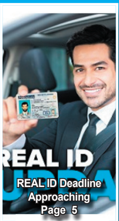
REAL ID Deadline Approaching Page 5