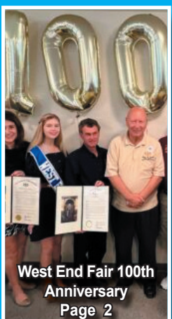
West End Fair 100th Anniversary Page 2