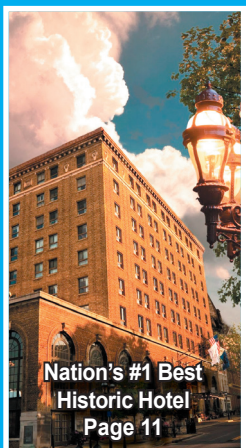
Nation's #1 Best Historic Hotel Page 11