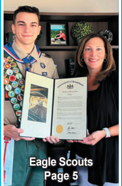
Eagle Scouts Page 5