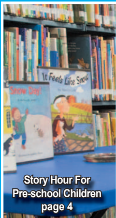
Story Hour For Pre-school Children page 4