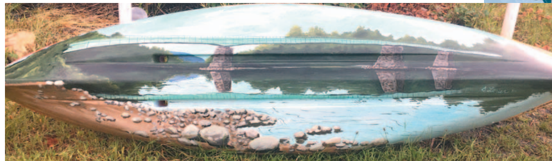
Slate Belt Rising had one of their 7 kayak murals on display that will be installed thruout Portland down town. This one is a view of the pedestrian bridge that spans the river from PA. to NJ. in Portland.