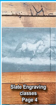
Slate Engraving classes Page 4