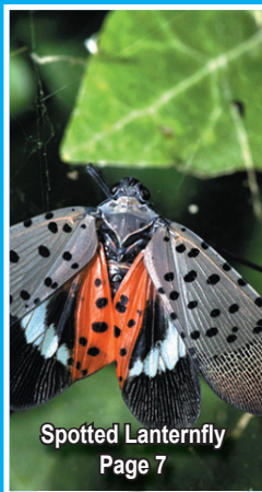
Spotted Lanternfly Page 7