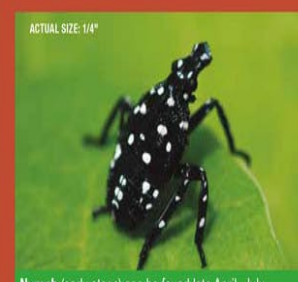
ACTUAL SIZE: 1/4" Nymph (early stage) can be found late April-July