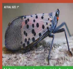
ACTUAL SIZE: 1" Adult (with wings closed) can be found July-December