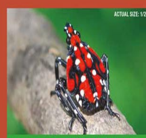
Nymph (late stage) can be found July-September