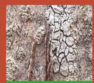
Egg mass (older) can be found January-June

THE PEOPLE YOU SHOULD BE CALLING! CONTACT US TO GET ON THIS PAGE TODAY!!