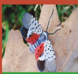
ACTUAL SIZE: 1 1/2" Adult (with wings open) can be found July-December