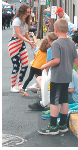
Pen Argyl's Weona Park is celebrating it's 100th anniversary