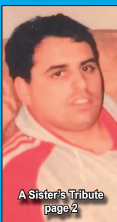
A Sister's Tribute page 2