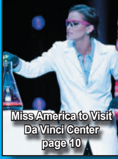
Miss America to Visit Da Vinci Center page 10