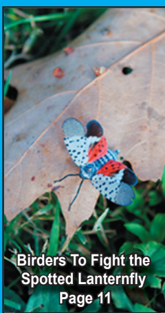
Birders To Fight the Spotted Lanternfly Page 11