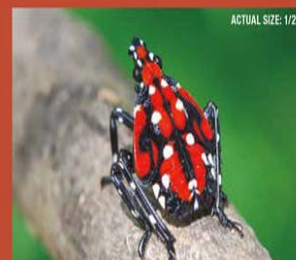
Nymph (late stage) can be found July-September