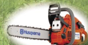
Husqvarna Chain saw

HELP WANTED Sales and Parts Apply Within