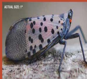
Adult (with wings closed) can be found July-December