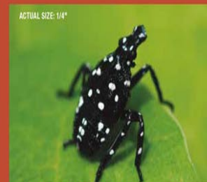
Nymph (early stage) can be found late April-July