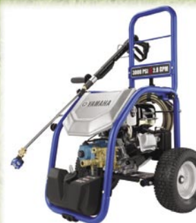
Yamaha pressure washers