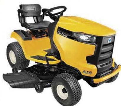
Cub Cadet XT Enduro Series