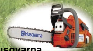
Husqvarna Chain saw

HELP WANTED Sales and Parts Apply Within