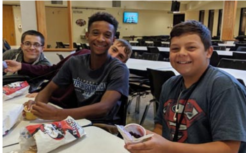
Machine Tool Technology students enjoy breakfast before starting class.

Current offerings include Blueberry, Chocolate, and Apple Cinnamon muffins, Pillsbury Cinnamonis, Pop-Tarts, and Cinnamon Toast Crunch Cereal Bars. Students are currently being surveyed to find out what other options they would like to see offered throughout the year.