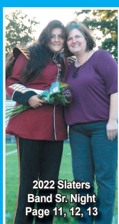
2022 Slaters Band Sr. Night Page 11, 12, 13