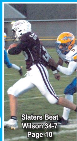
Slaters Beat Wilson 34-7 Page 10