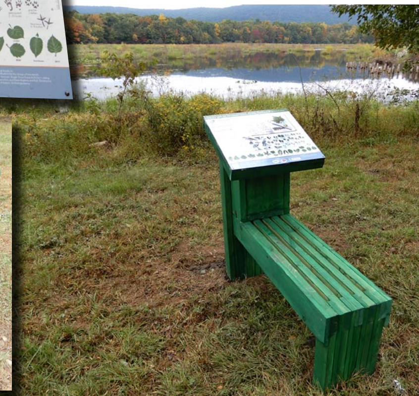
Four journaling benches & one stand up unit were installed at Minsi Lake